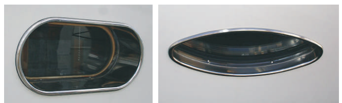
LO Oval portholes